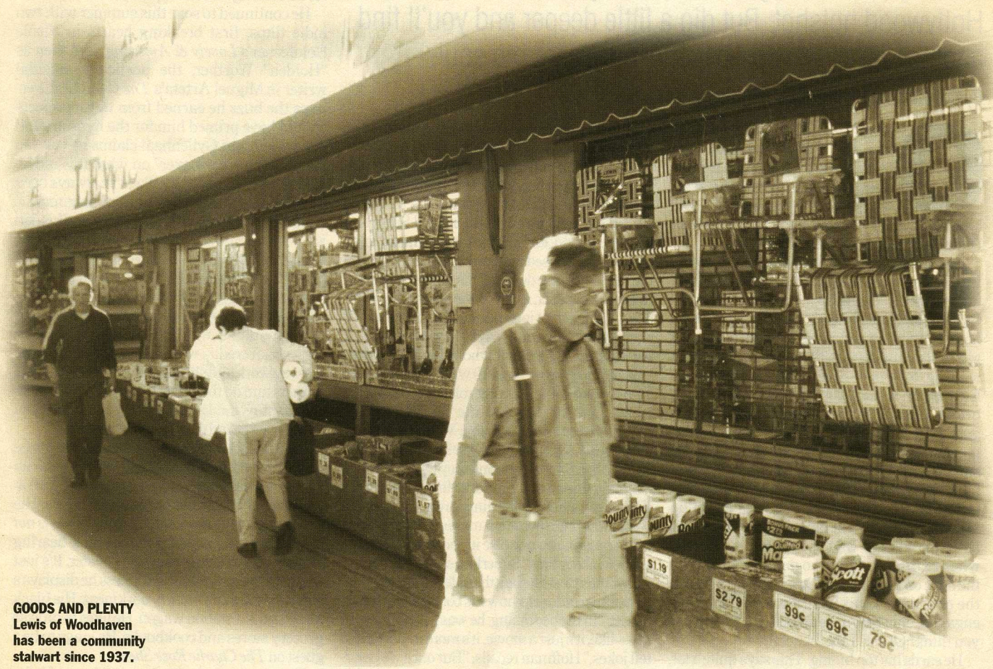
GOODS AND PLENTY Lewis of Woodhaven has been a community stalwart since 1937.